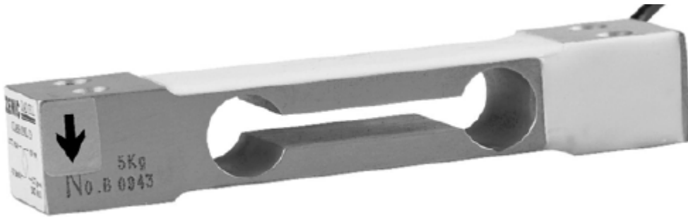
Model L6D / L6D-R1