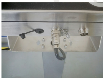
Cable connection security seal