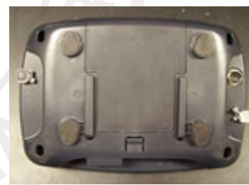
Indicator with wire security seal