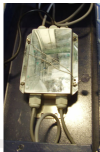
Junction boxes with wire security seals