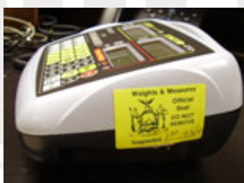
Indicator with paper security seal